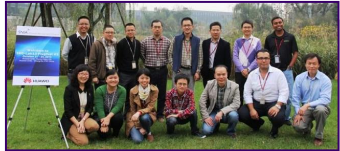
THANKS FOR HOSTING, HUAWEI! Outside Huawei's ChengDu Lab