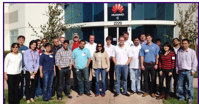
SMI-Lab Plugfest attendees in Santa Clara